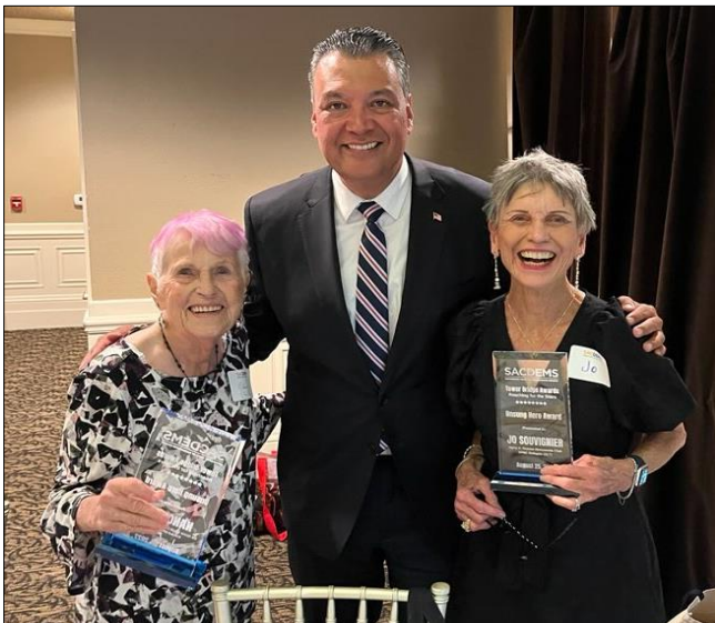
Photos w/elected officials - Top Middle: The Hon. Jim Cooper, Sheriff, with Nancy Fox; Bottom: The Hon. Alex Padilla, U.S. Senator (D-CA)