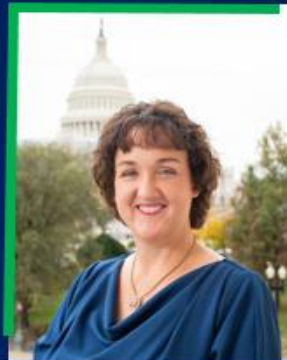
The Honorable Katie Porter United States Representative

Congressional Representatives Barbara Lee, Adam Schiff and Katie Porter have all announced campaigns, with more candidates likely to emerge.