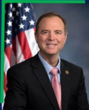
The Honorable Adam Schiff United States Representative