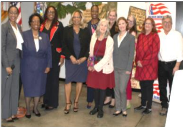
WDSC Executive Board Members:

A special thank you to The Honorable Malia Cohen, California State Controller, for conducting the installation of the Executive Board!