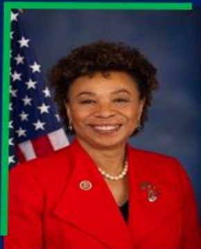
The Honorable Barbara Lee United States Representative