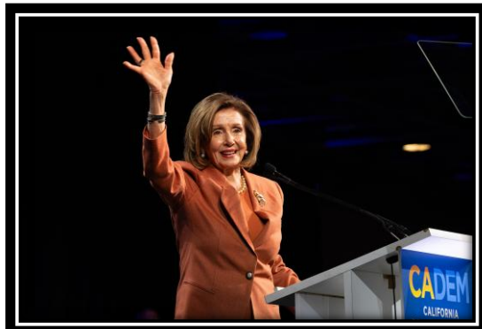
The Honorable Nancy Pelosi U.S. Representative/Former Speaker of the House

All of this took place in a 2-hour morning session, and another 2-hour afternoon session. My job was to listen intently, take notes and hopefully make the best decision for the future of our State.